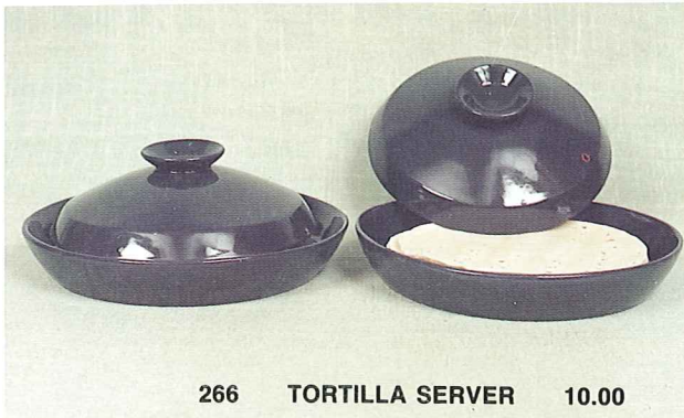
266 TORTILLA SERVER 10.00