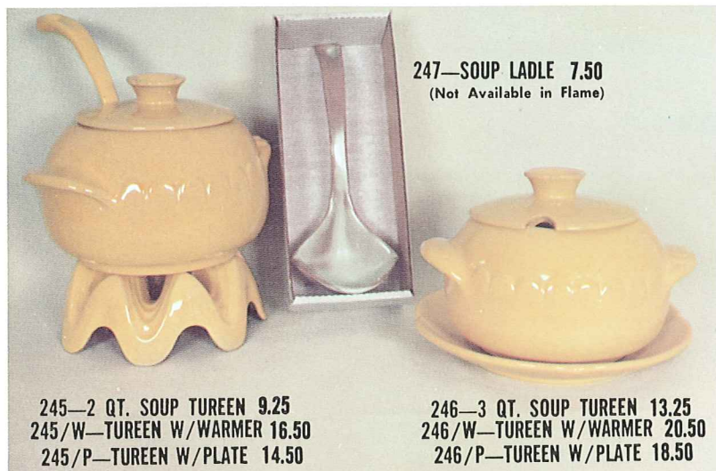
247—SOUP LADLE 7.50 (Not Available in Flame)

245—2 QT. SOUP TUREEN 9.25 245/W—TUREEN W/WARMER 16.50 245/P—TUREEN W/PLATE 14.50