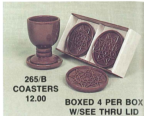
265/B COASTERS 12.00