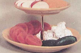
#280 3 TIER W/BOWL $19.00